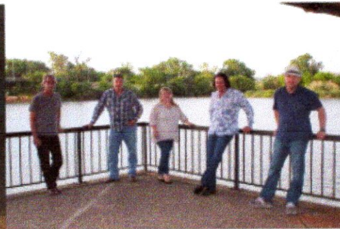
MIDNIGHT MUSTANGS BAND SATURDAY 8PM -12

for entry forms, details and more information